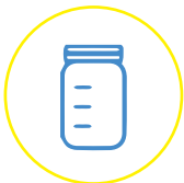
Empty mason jar