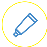
One tube of dry glitter