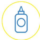
One tube of glitter glue